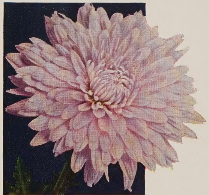
CHRYSANTHEMUM, Lavender Lady